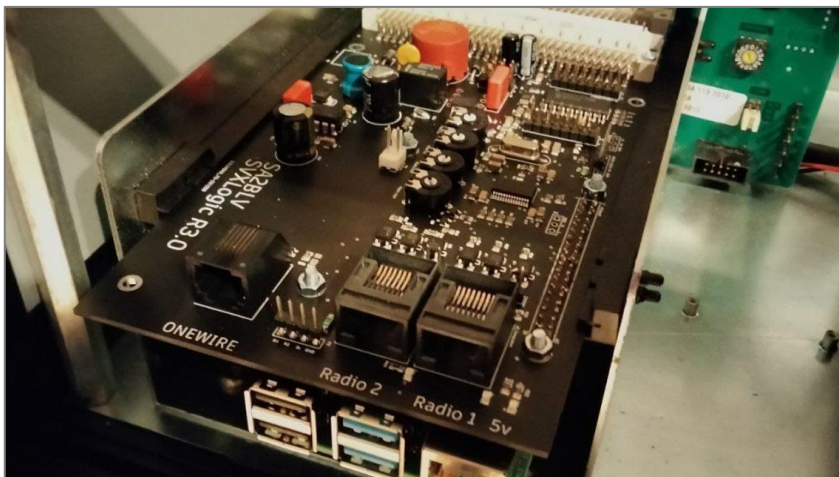
SA2BLV's card, mounted in an Ericsson F800.

Usually all nodes monitors (as a minimum) talk group 240, its own district talk group and a local